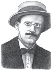
James Joyce 1882-1941

James Joyce is a major literary figure of the first quarter of the twentieth century. He is known for his bold experiments in narrative techniques in fiction, and Ulysses is his most famous work. 'Eveline' is one of the fifteen stories of Dublin life that form Dubliners, first published in 1914. It is a sympathetic portrayal of Eveline, who has within her reach escape from the drudgery of her life but cannot gather enough courage to seize it.